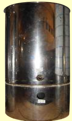
Stainless steel Tank