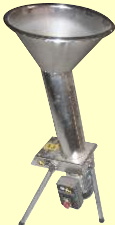
Dry & Wet Grains Miller