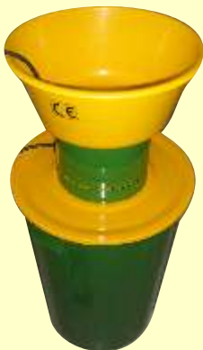
Dry Grains Miller