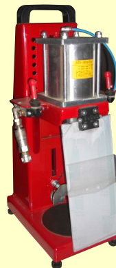
Pneumatic Corking Machine