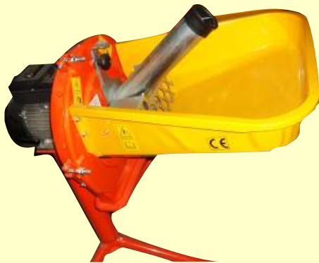
Dry Grains Miller