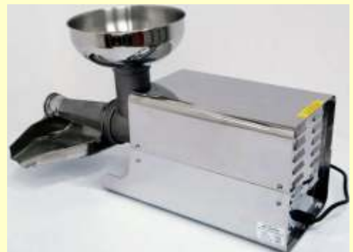
JM500 Fruit extractor