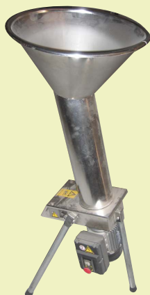
Dry & Wet Grains Miller