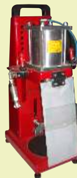
Pneumatic Corking Machine