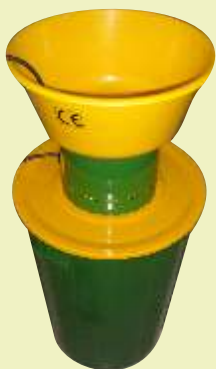
Dry Grains Miller