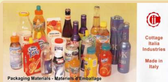
Packaging Materials - Matériels d'Emballage