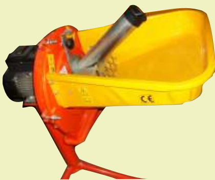
Dry Grains Miller