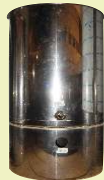
Stainless steel Tank