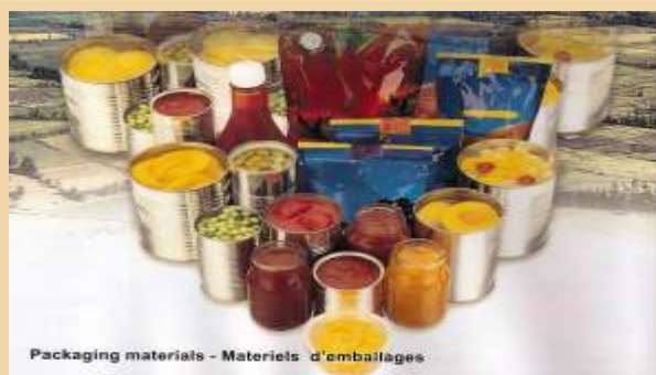
Packaging materials - Matériels d'emballages