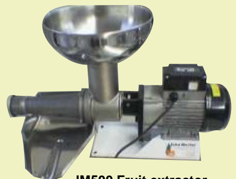
JM500 Fruit extractor